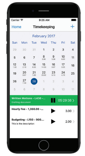
Native Mobile Timekeeping App

Workflows can automatically generate and assign tasks to lawyers and staff, send automated email, generate documents from templates, fill in form fields, and create new records.